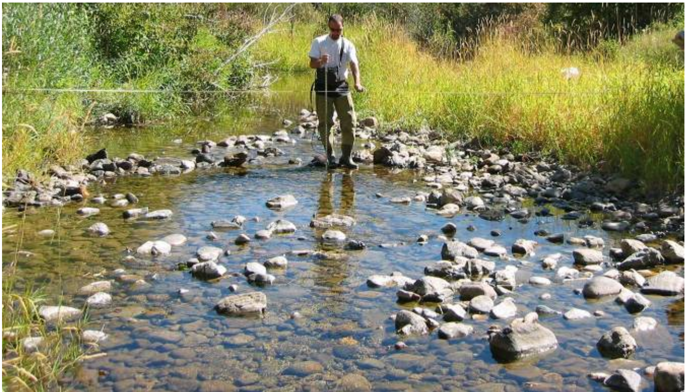
REACH PHOTO: 38 mg/m 2

Collect chlorophyll at sites where growth is estimated to be >50 mg/m 2 . If in doubt, collect a sample