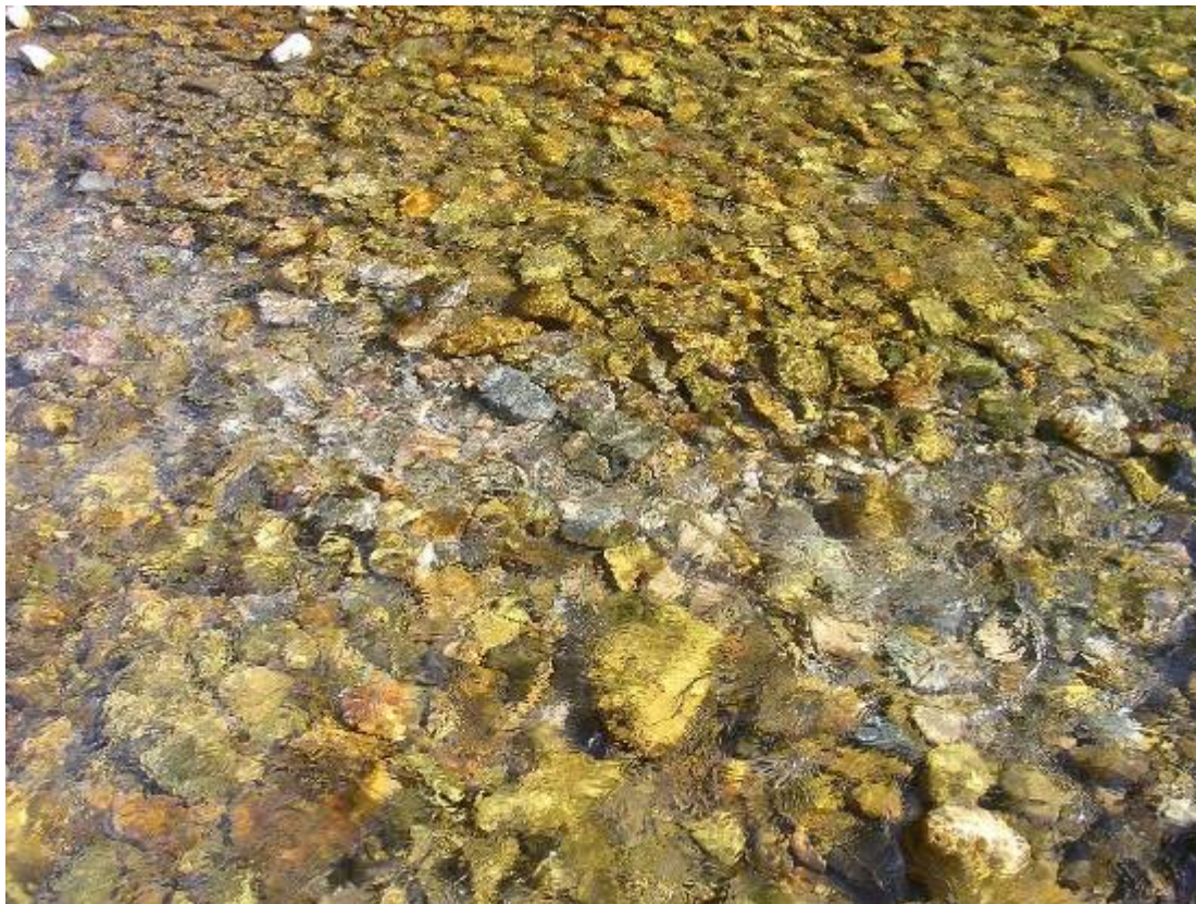
SUBSTRATE PHOTO: 15mg/m 2