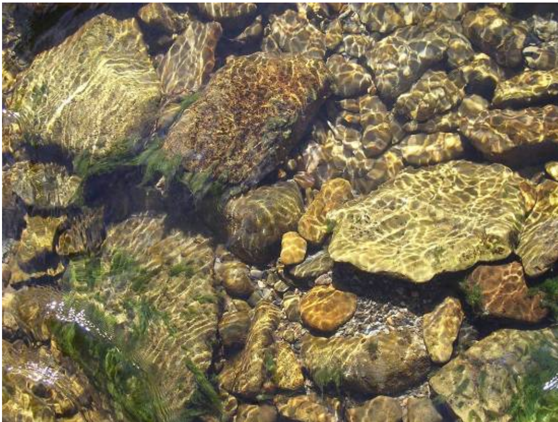
SUBSTRATE PHOTO: 137 mg/m2

Collect chlorophyll at sites where growth is estimated to be >50 mg/m 2 . If in doubt, collect a sample