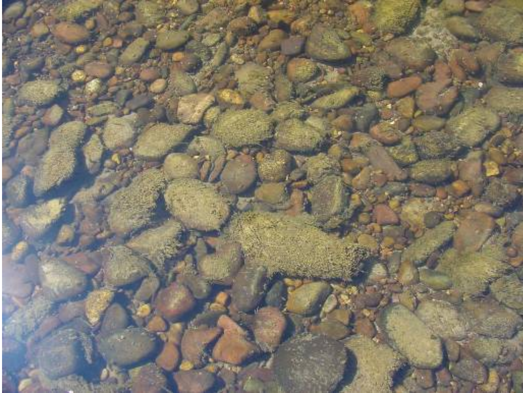
SUBSTRATE PHOTO: 106 mg/m2