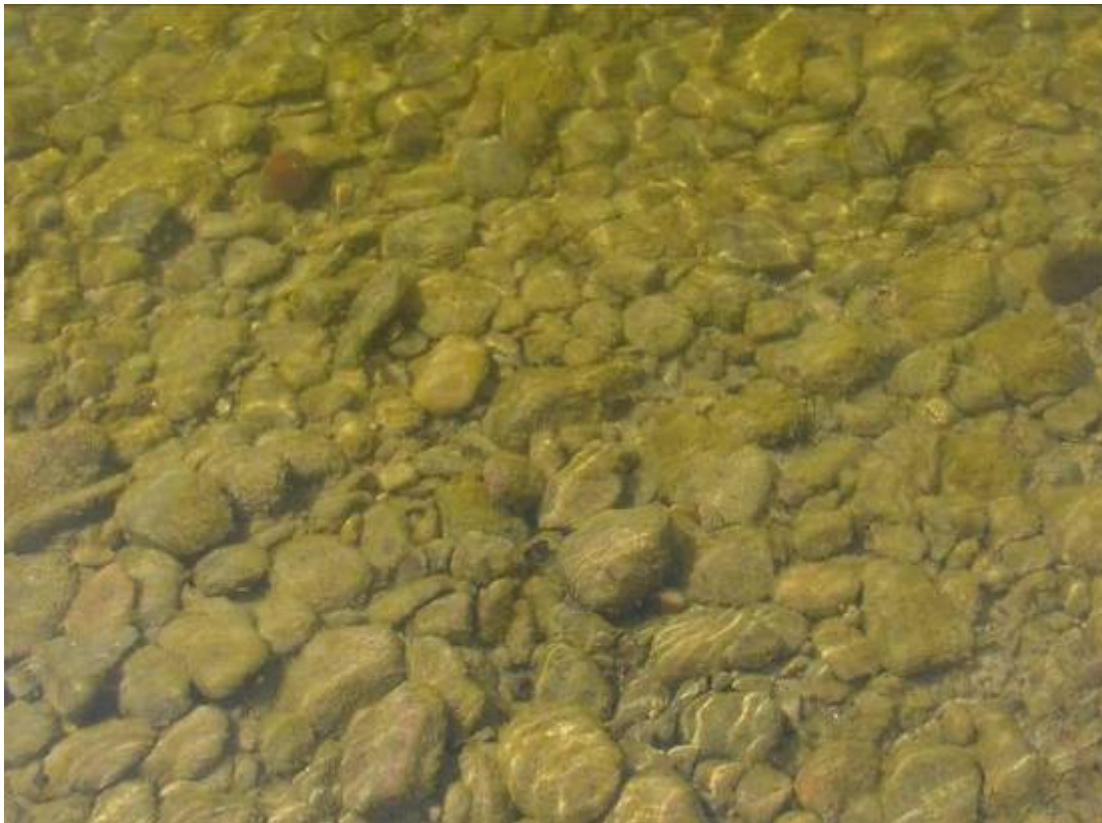
SUBSTRATE PHOTO: 60 mg/m2

Collect chlorophyll at sites where growth is estimated to be >50 mg/m 2 . If in doubt, collect a sample