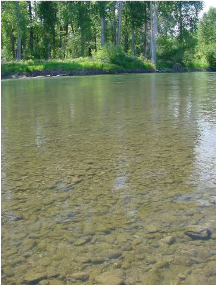
REACH PHOTO: 152 mg/m 2