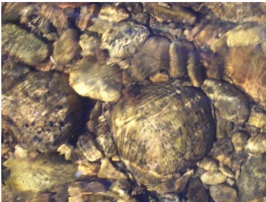
SUBSTRATE PHOTO: 23mg/m 2

Collect chlorophyll at sites where growth is estimated to be >50 mg/m 2 . If in doubt, collect a sample