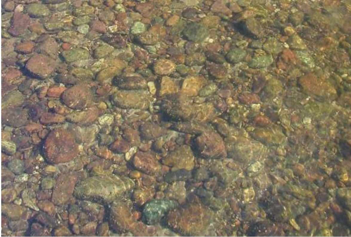
SUBSTRATE PHOTO: 44 mg/m2