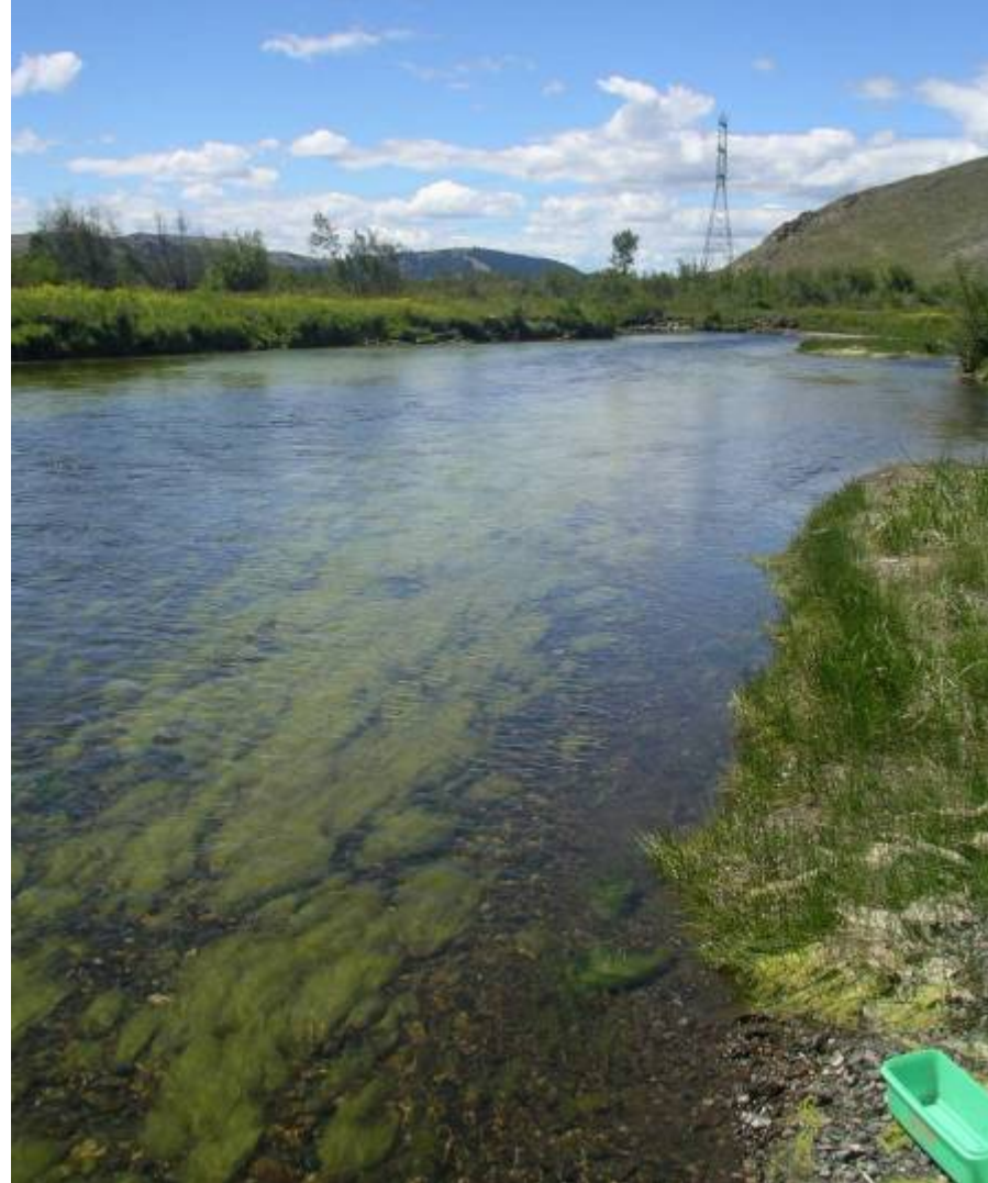
REACH PHOTO: 96 mg/m 2

Collect chlorophyll at sites where growth is estimated to be >50 mg/m 2 . If in doubt, collect a sample