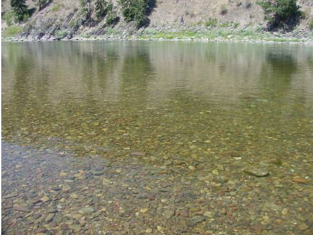
REACH PHOTO: 10 mg/m 2