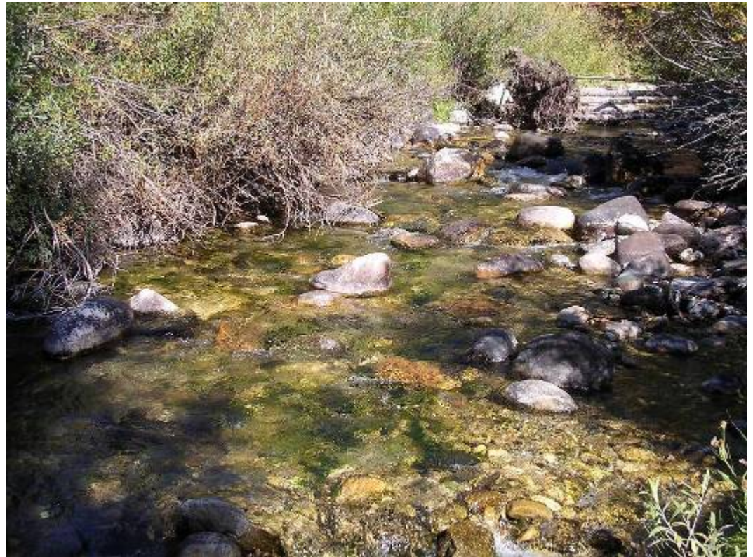
REACH PHOTO: 154 mg/m 2

Collect chlorophyll at sites where growth is estimated to be >50 mg/m 2 . If in doubt, collect a sample